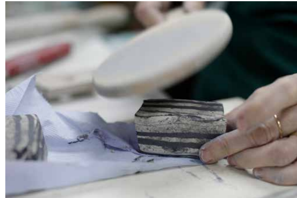
8 Using a paddle, I whack each side to make sure there is no trapped air and the joins are strong. I then continue to make more strips.