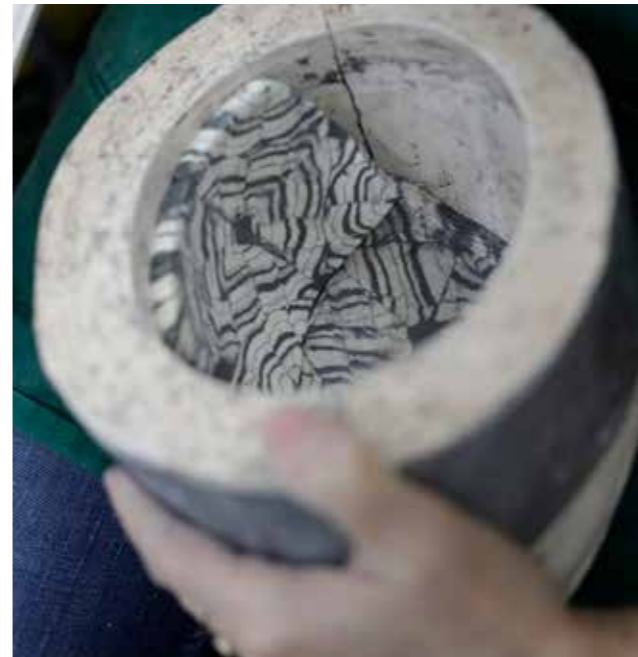
16 I then start to join more slabs together, cutting to fit, bevelling, scoring and painting the edges with slip as I go. I bring the slabs up to just below the top edge of the mould so that I can add a rim to finish.