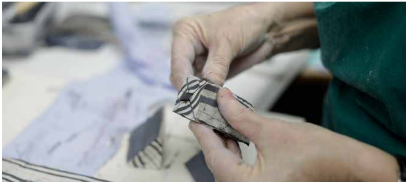
7 I cut the strip in half again and join the two halves. I now have a squared strip made up of four triangles, roughly mirroring each other, with a coloured diamond through the centre.