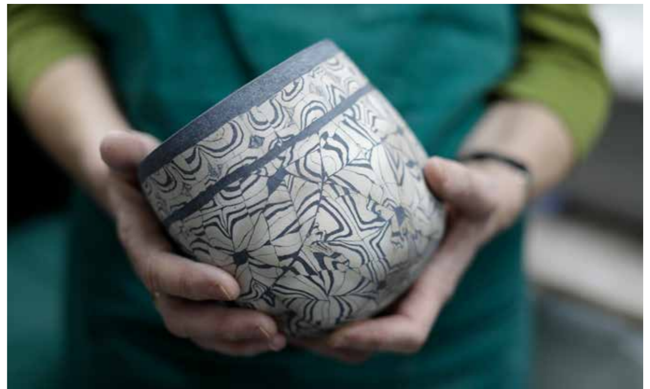
25 Once all the slip has been scrubbed off, the piece is left to dry. I then warm it in a low oven and wax it with a colourless furniture polish to give it a soft sheen.

See Barbara at work on our video channel at vimeo.com/ceramicreview