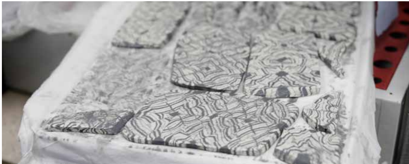
12 I make several slabs of different patterns this way, creating large squares and some rectangular shapes to give myself a selection to piece together in the mould.