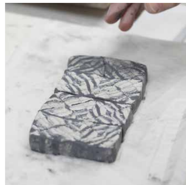
10 I lay the slices onto a damp cloth, joining each slice to the next to create a slab, still applying slip between the joins.