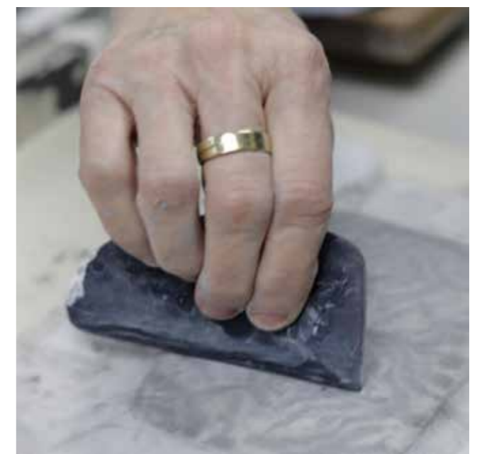
11 The slab is then covered with a wet cloth and I scrape across the surface with a firm rubber kidney in all directions to close any gaps.