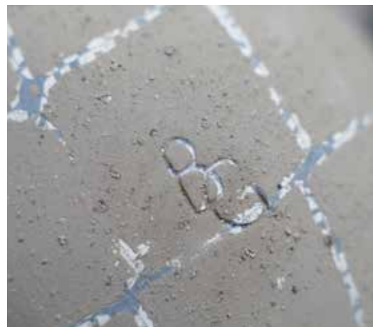
22 I then paint on a crank slip and leave it to dry. I wrap the piece in foil and make holes in the foil to allow some smoke in.