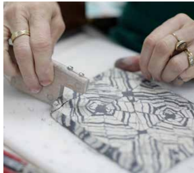
14 I choose a slab to start with, mitre the edges with the bevel tool and score the edges.