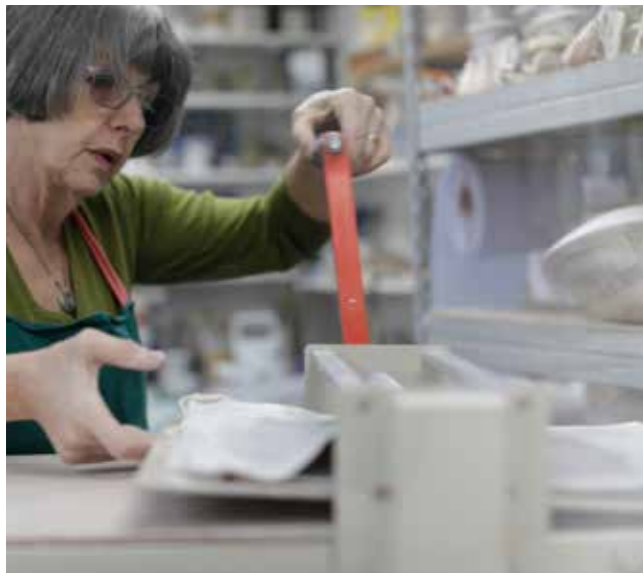
13 The slabs are put through the slab-roller to ensure they are all the same thickness and also to strengthen them.