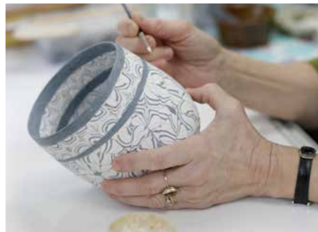
21 Once fired and sanded, I decorate further using wax or other resists, highlighting key areas of the pattern.