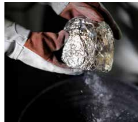
24 When there is no more smoke, I extract the pot from the ashes using fireproof gloves. I then plunge the unwrapped pot into hot water to remove the crank slip.