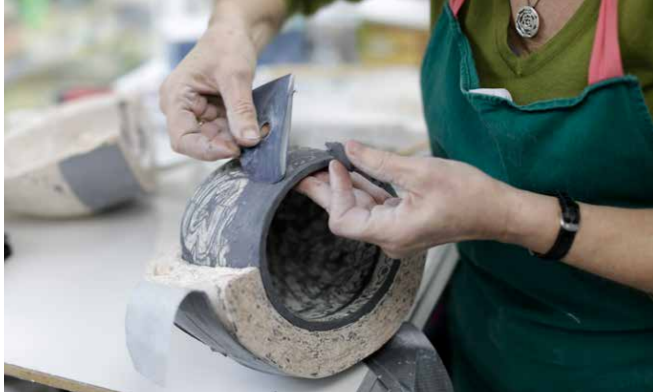
19 After spending a day or so in the mould, well wrapped in plastic, I lift off one half of the mould. I make sure there are no gaps, filling any with thick slip and smoothing it in with a rubber kidney. I scrape the whole surface with a serrated kidney and repeat on the other side.