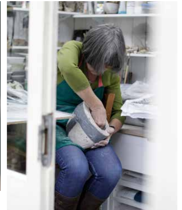
17 I scrape the joints with a finely serrated kidney to make sure they are closed.