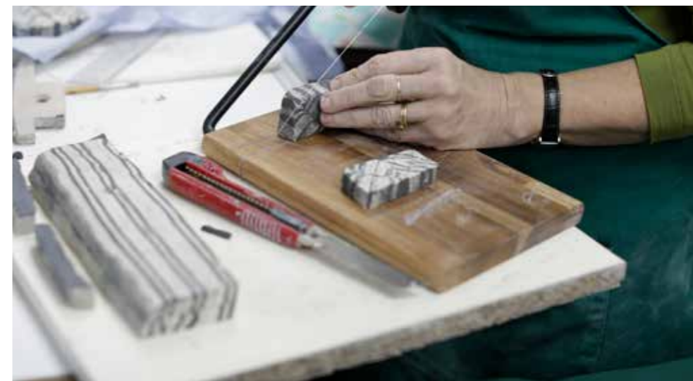
9 The strips are joined together, adding a thin coloured triangle along each join. I then use a cheese slicer to cut even thickness slices, just a bit thicker than needed.