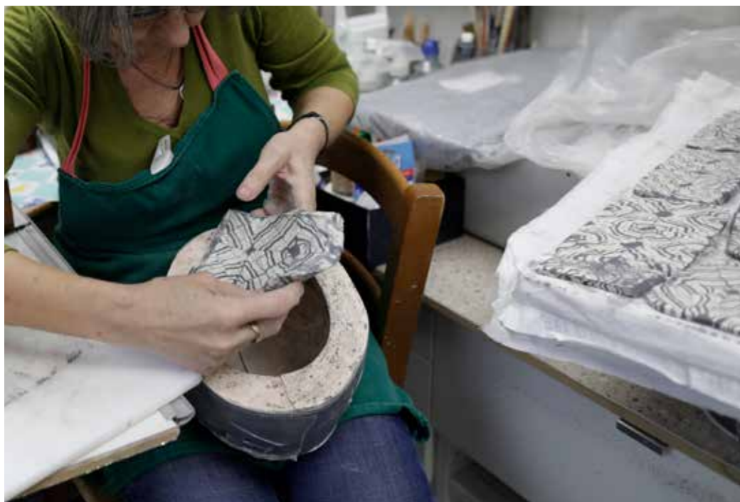
15 Using a damp sponge to press it in, I ease the first slab into the mould.