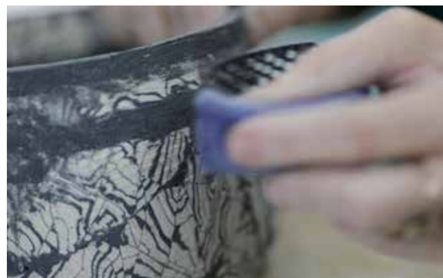
20 When the piece is leatherhard, I surform the surface and scrape it with various flexible smooth kidneys. This evens out the thickness, cleans up the pattern and refines the top edge. The pot is then wrapped in plastic on a foam block and left for a fortnight or more. I change the plastic frequently to allow moisture to escape slowly. When completely dry, I sand the piece with wire wool. It is then fired in my electric kiln to 1040°C and sanded again with wet and dry diamond paper.