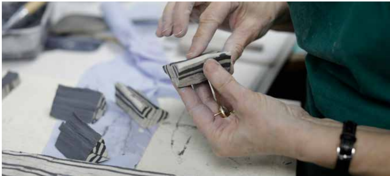
6 One strip is cut in half and joined and a small triangular strip of the coloured clay is pressed along the join.