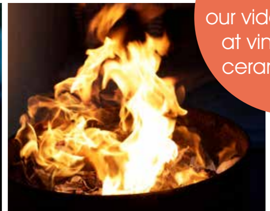
23 I fill my smoke-firing bin with crumpled up newspapers, nestling the pot in the centre. After it is lit and burning well, I cover with the lid.