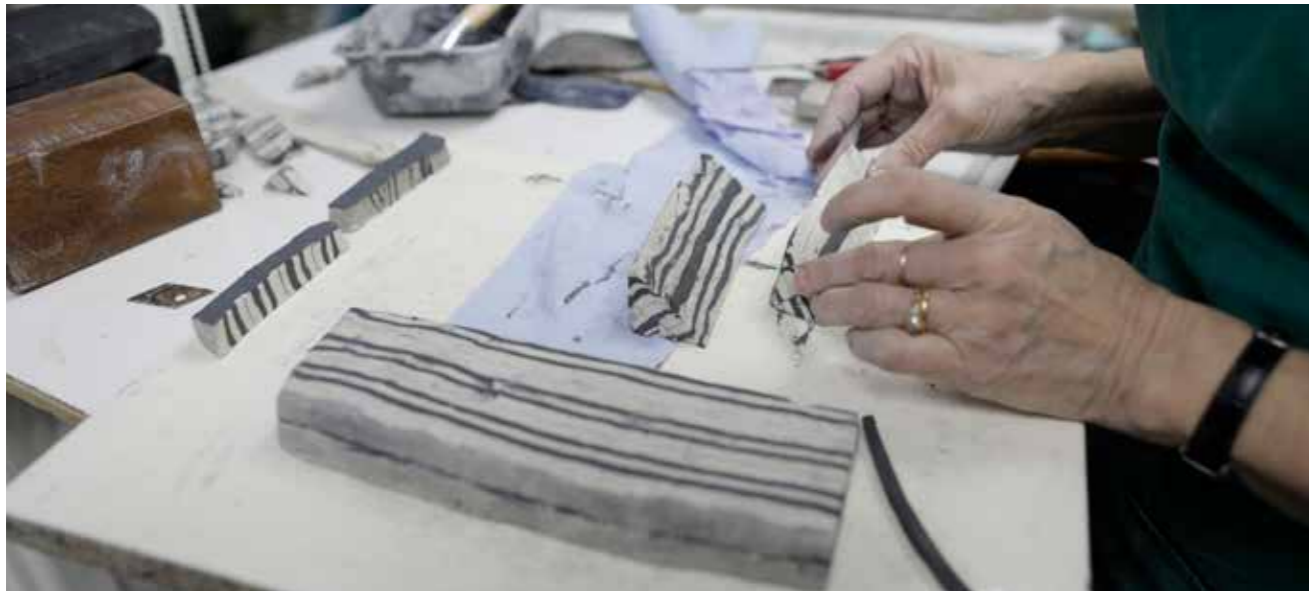
5 Two slices are joined together and the block is rolled until it is the same height as my bevel tool. I then use the bevel tool to cut triangular strips along the length of the block.