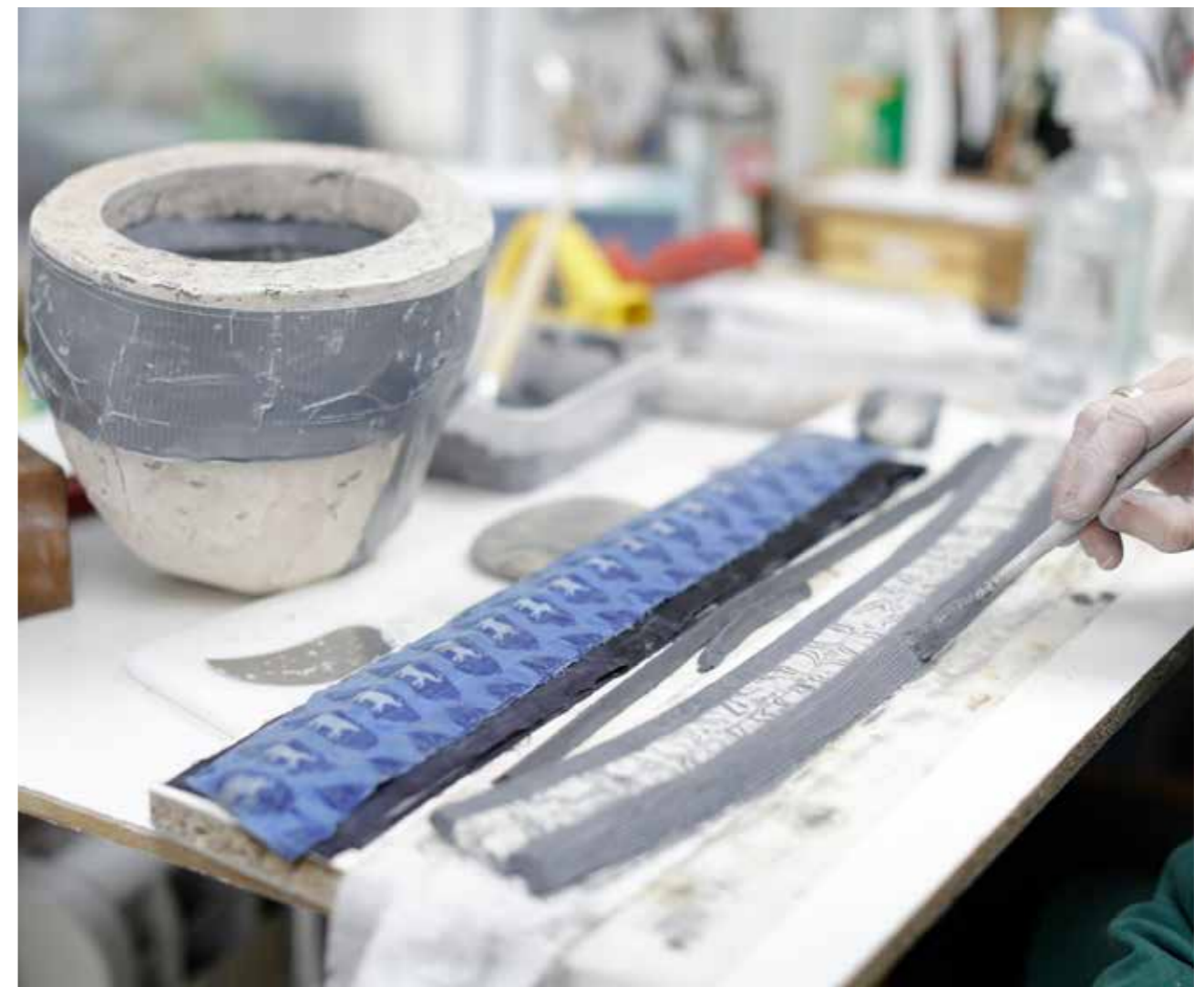
18 Finally, I prepare a strip for the rim. Getting it into the mould in one piece is the trickiest part as it is important to only have one join on the rim to avoid cracking on the finished edge.